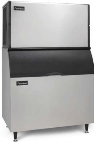
ICE2106 on B100